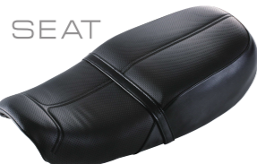
Seat Cover [Reshaping, Cover with Dimple Surface] ¥ 30,000.-